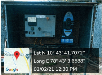
Photo of Sensor outside the tank Photo of Sensor inside the tank

Lat N 10° 43' 41.7072" Long E 78° 43' 3.6588" 03/02/21 12:30 PM