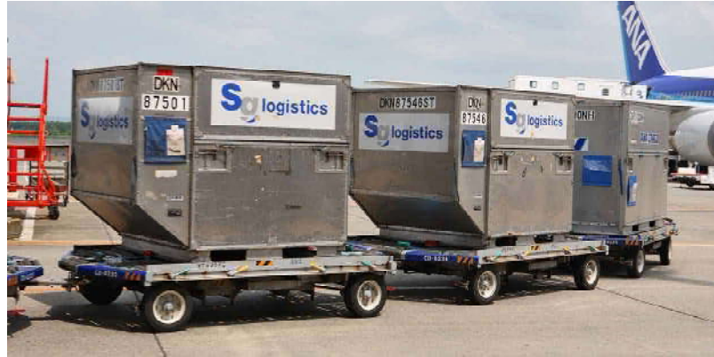
Fig 3.1: Unit Load Devices

pallets in position. Aircraft that are wide bodied and narrow bodied use ULDs for the purpose of consolidating baggage or cargo items prior to loading into aircraft hold by specialised hydraulic lift equipment. The ULDs are then handled manually to the position on board utilizing roller floors before being secured in the position. ULDs must be either weighed, or the number of baggage items per container must be within a specified range and standard baggage unit weights applied.