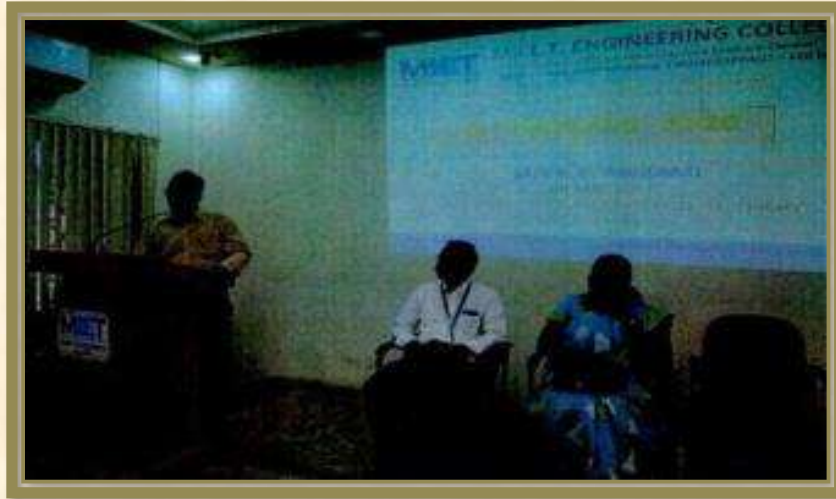
HR Conclave (Guest Lecture)