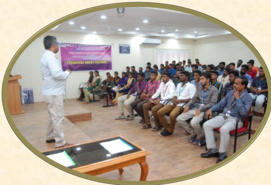
Griha Concepts of Green Building(Guest Lecture)