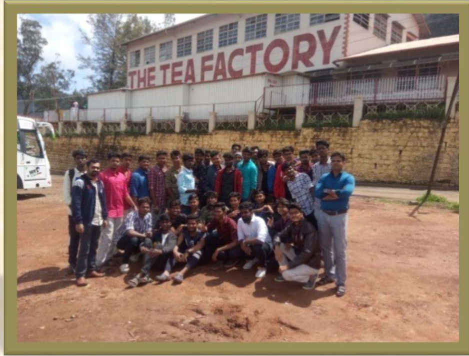
Dodabetta Tea Factory-Ooty.