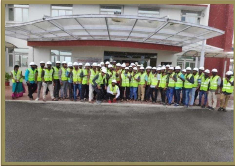
D.P World, India Gate Terminal Pvt. Ltd.- Cochin