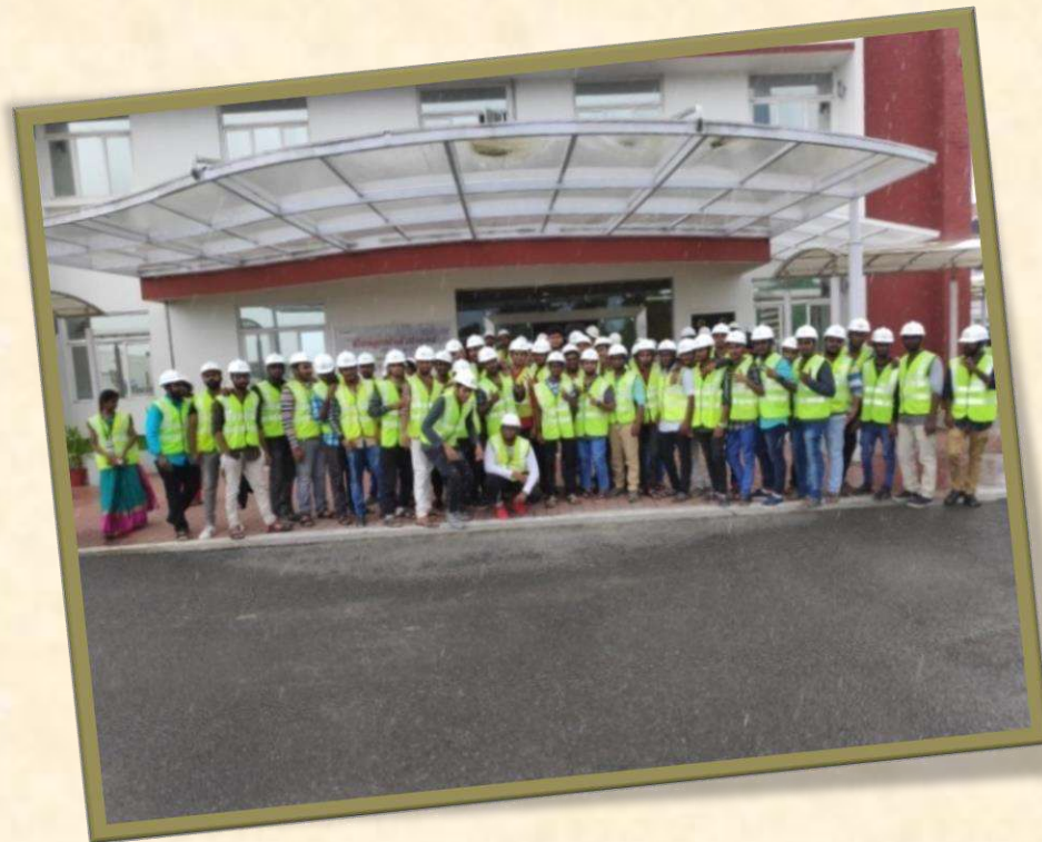
Student's Industrial Visit