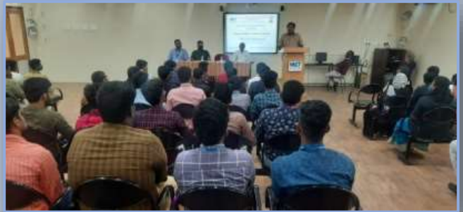
Guest Lecture on Employability Skills