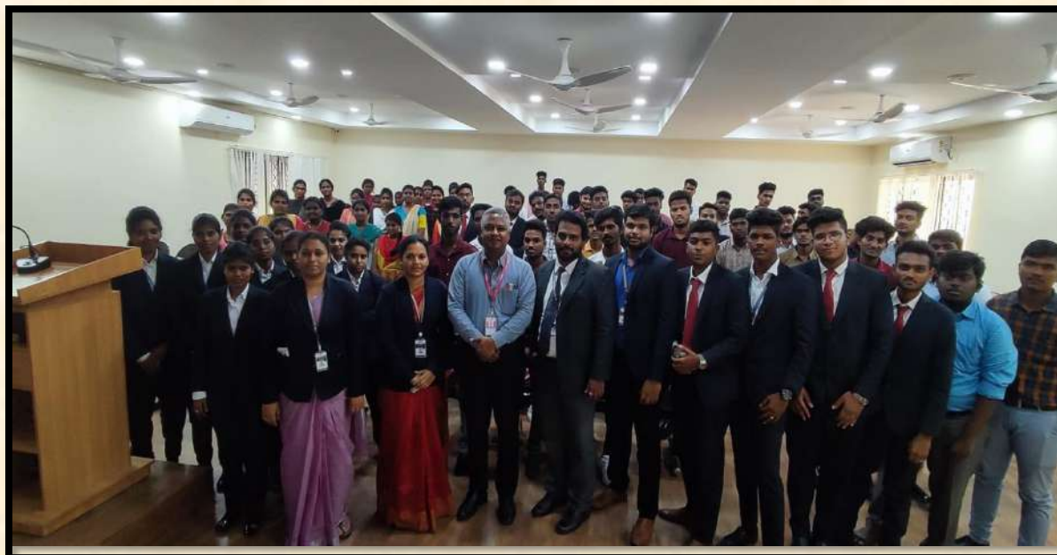
Recent trends in HR