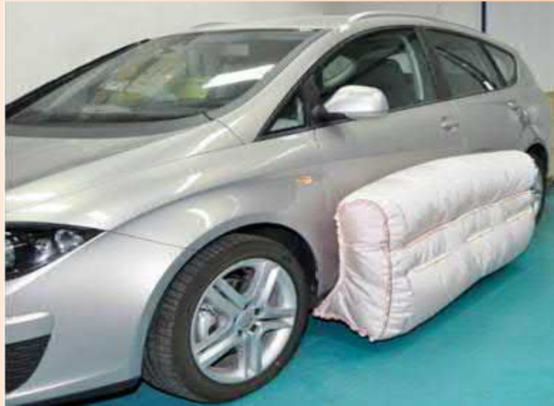
External airbag inflated

Even tiny changes in an incoming object's direction during these final milliseconds could drastically change how the airbags should engage, so lidar must be fast and accurate.