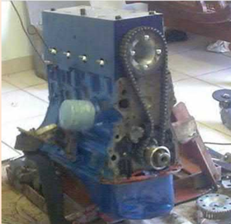
Rotor valve tube cylinder head

More economical, more powerful and more environment friendly cylinder head for any 4 stroke internal combustion engine.