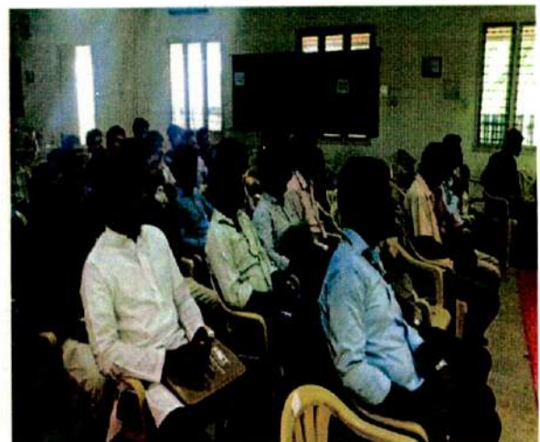
Faculties and Alumni in the event